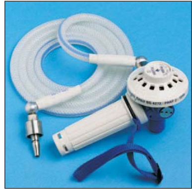
Part Number 6005 (Polymer Hose) Part Number 6007 (Silicone Hose)