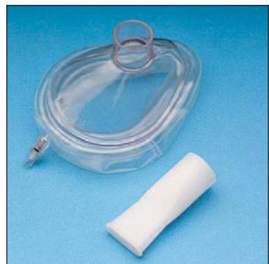
Facemask Part Number 6815 (Large) 6816 (Medium) Mouthpiece Part Number 6061