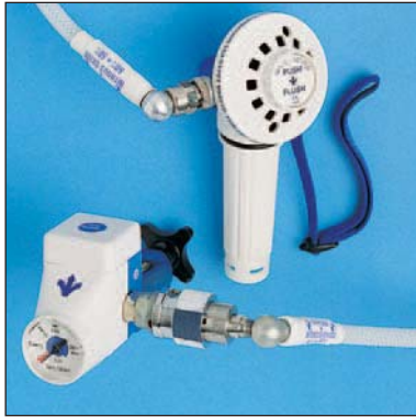
Part Number 6000 (Polymer Hose) Part Number 6002 (Silicone Hose)