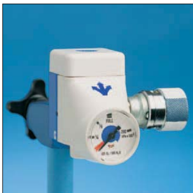
Part Number 6010