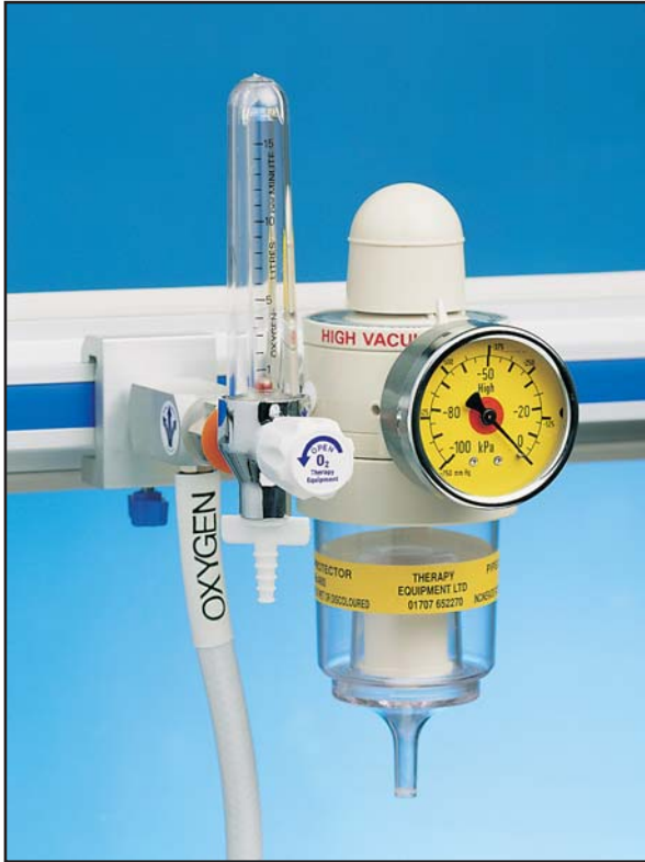
PART No. 4425