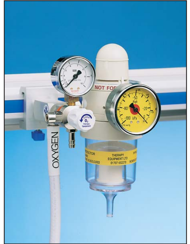
PART No. 4426

The Therapy Equipment Injector Suction Assemblies are ideal for all types of emergency suction use, and can be fitted to all types of trolleys.